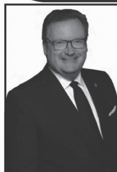
Your Strong Voice in Ottawa

Member of Parliament Saskatoon-Grasswood